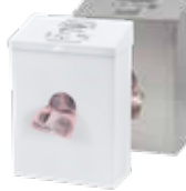
Scensibles® Metal Combination Receptacle