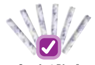
Comfort Plus® Tampons CPCR200**