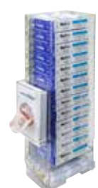
Comfort Plus® Courtesy Dispenser