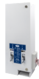
Dual Channel Vendors