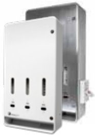
Evogen® EVNT6 Tri-Vend High Capacity No-Touch Vendor

Free Scensibles® Disposal Bag Dispenser and refill pack are included in specially marked period product dispenser cartons. They are marked with this symbol on the back of this page.