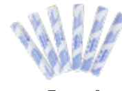
Tampax® Tampons T500