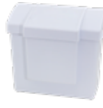
Plastic Receptacle (Removable Rigid Plastic Liner)