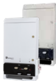
Evogen® EV1 Vendor