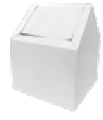
Swing Type Double Entry Metal Receptacle