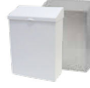
Metal Receptacle (Hinged Bottom)