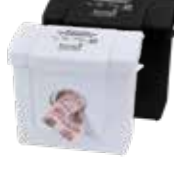
Scensibles® Plastic Combination Receptacle (Removable Rigid Plastic Liner)