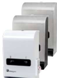
Evogen® EVNT4 No-Touch Vendor