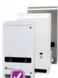
Evogen® EVNT3 No-Touch Vendor